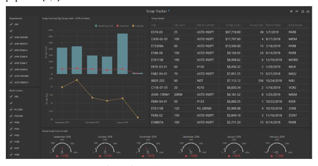
Figure 3 Quality dashboar [10]

Knowing which production processes and operations aggregated into work centers operate at a high level of production quality and which do not is essential for the efficient running of production operations in terms of downtime and poor-quality costs. The key is to have visualized data on individual production operations in real time in the form of key quality parameters and their tolerances. Plant configuration data and operating parameters, along with sensor data, provide valuable information. Combining this configuration data with operation output quality data allows SSBI tools to search for information on cause-and-effect patterns between device configuration and operation output quality. Thus, managers can prevent the emergence of poorquality outputs by proactively configuring equipment based on visualized results. Another use is to identify the factors that affect the quality of process outputs to reduce the likelihood of a mismatch in subsequent operations. These factors are then analyzed by statistical methods, which result in, for example, a cluster map that visualizes the individual outputs of the operation by separating the outputs of the operations by the degree of probability of deviation from the tolerance limits of quality indicators. This type of visualization allows for efficient benchmarking configuration of test equipment. [6,7]