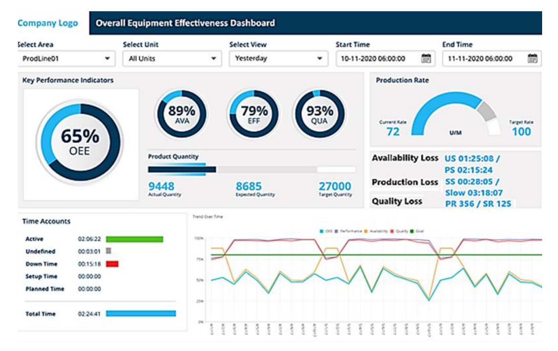
Figure 2 OEE dashboard [9]

SSBI tools from some providers support the creation of mobile dashboards for mobile devices and tablets, which further confirms the level of increased flexibility in the use of automated reports. Managers thus always have up-to-date information on key KPIs with them.